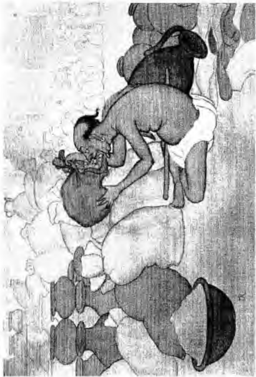
Weak-appetite shows his feats of eating.